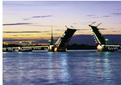
Neva River boat trip