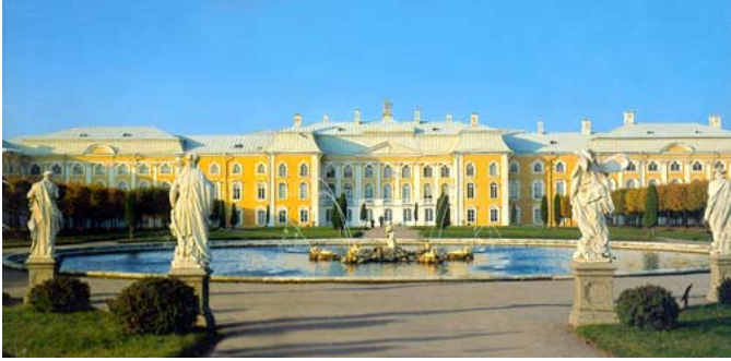
Royal Palace Peterhof