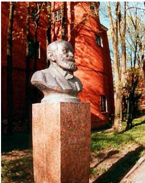
Pavlov's Tower of Silence